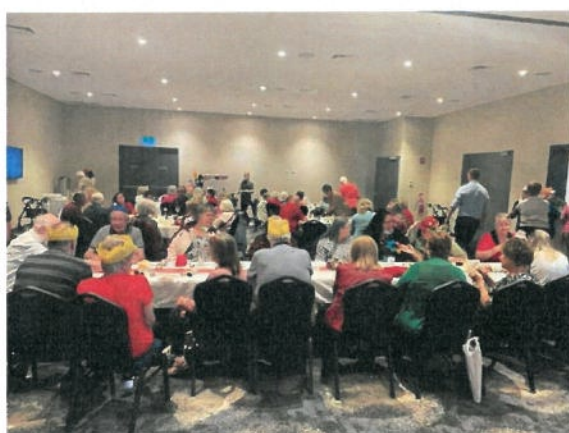
All together for Christmas 2021

For information on our Annual Financial report please see our separate documentation.