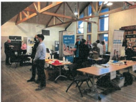
Careers Night for Grown Ups