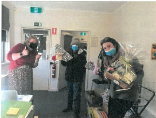
Committee shows their appreciation for the staff