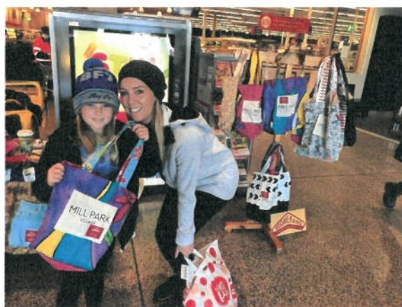
Branching out to Mill Park and beyond!

Boomerang Bags made some welcoming bunting for the House, as the issue of front entrance branding and appearance was highlighted for improvement at the House strategic planning day. We will also soon be installing street signs for both Boomerang Bags and the House so keep your eyes peeled on the community group markers at the entrances to town. We feel it's a worthwhile investment and raises awareness of both our organisations.