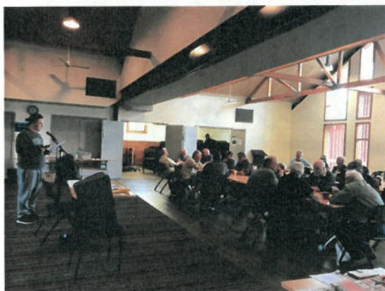
Big Blokes November Trivia Quiz!