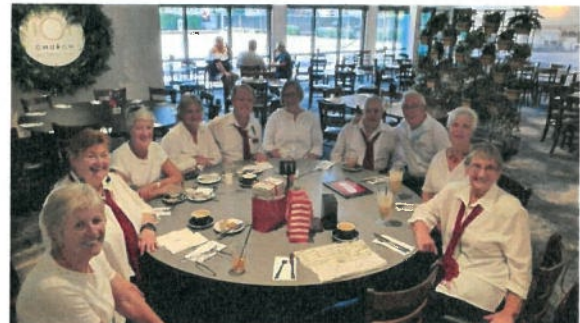
All together at Whittlesea Bowls