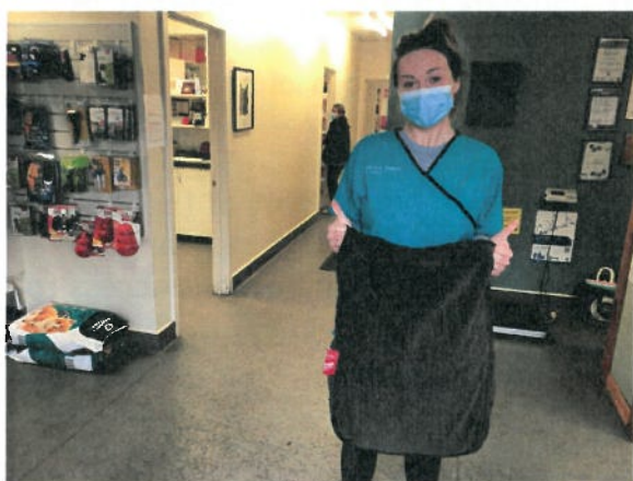
Scrap stuffed dog bed for Kinglake Ranges Vet Clinic

We are a zero waste group, even tiny scraps and unusable fabric is saved from the bin and repurposed as stuffing for foot stools and padded dog beds. We have made three ottomans and giant dice for the library. Two scrap-stuffed dog beds were donated to Kinglake Mountain Vet.