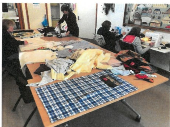
Boomerang Bags team in action