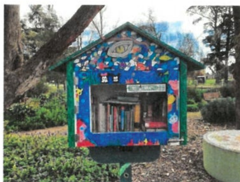
WCG Little Library is installed