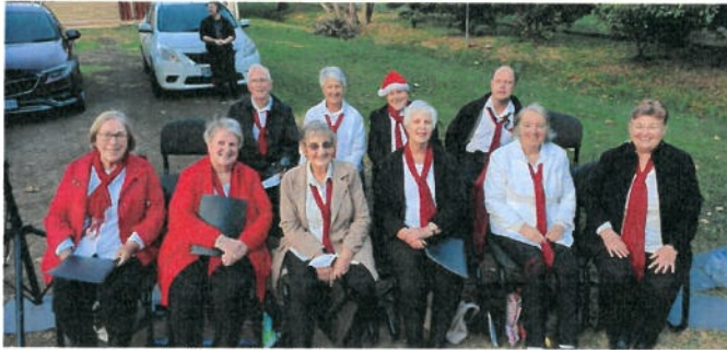
Christmas Carols Carpark style!