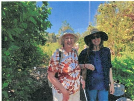
Bus Trip to The Edible Forest