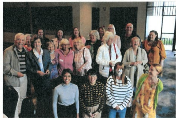
VCOSS Listening Tour Volunteers