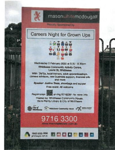
Careers Night for Grown Ups Finally gets off the ground