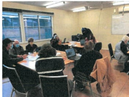
Digital Literacy sessions are a big hit