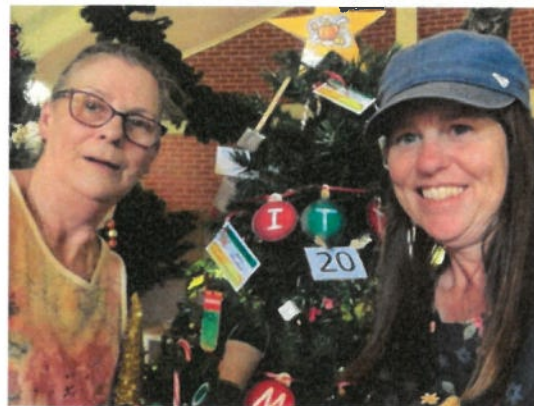
Ag Society Xmas Tree Extravaganza entry