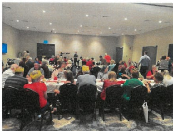
All together for Christmas