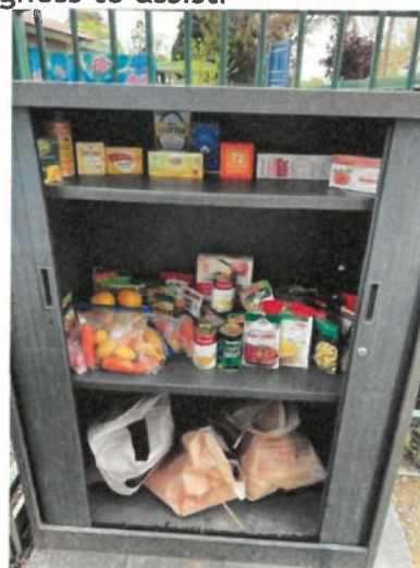
Our new Community Pantry