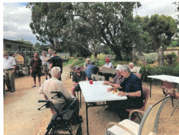
Enjoying the sunshine