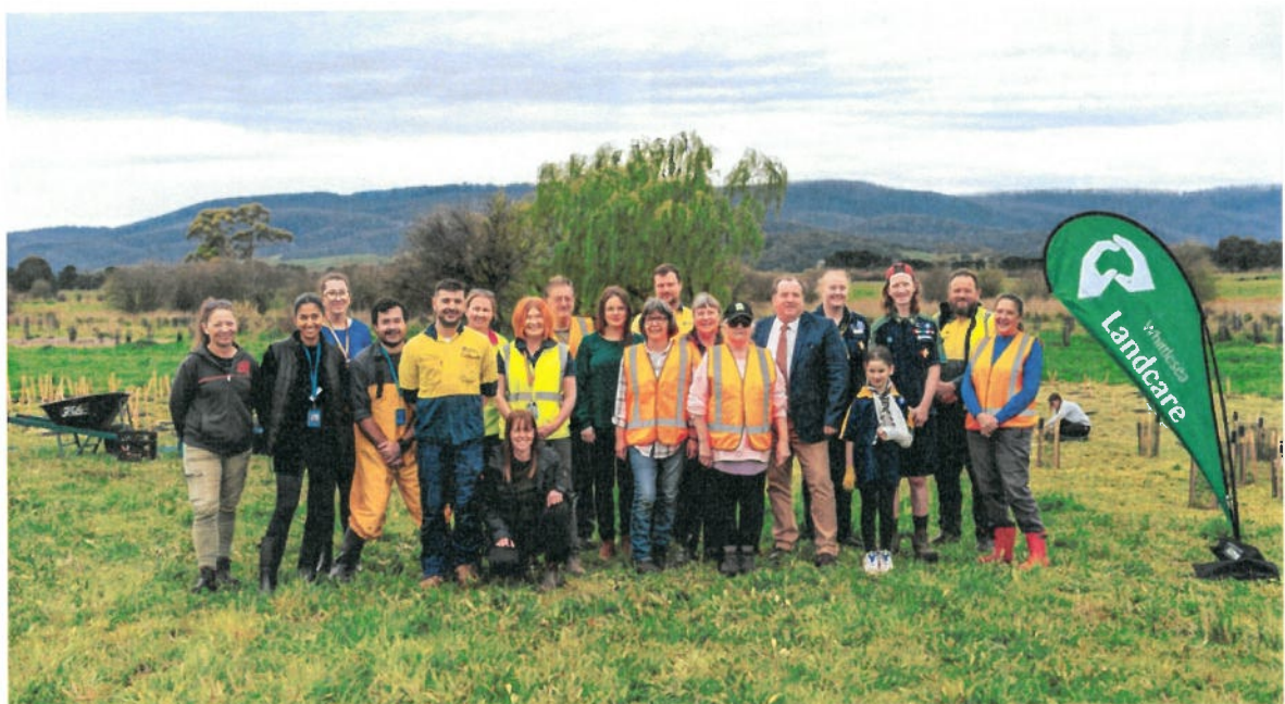
Landcare Team Tree Planting at Tambo Conservation Area

Whittlesea Landcare would like to Thank Whittlesea Community House for the assistance and guidance over the last 4 years.