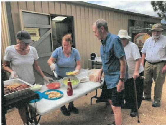
Big Blokes enjoy a BBQ at the Garden