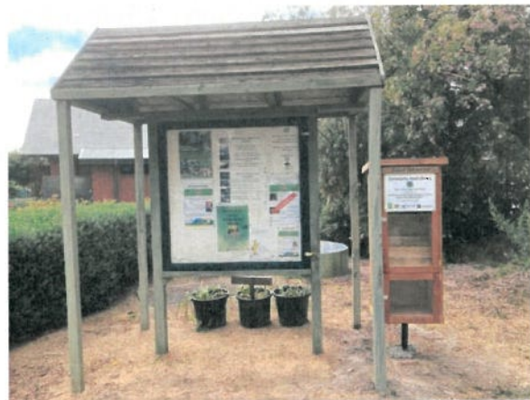
The Seed Library

We participated in the CoW 'Gardening Together Again' Program. This program was run by council as a pandemic recovery project to encourage new community gardens and re-invigorate existing community gardens. This program consisted of 10 activities, including a bus trip to other community gardens, online and in person workshops and lunch with guest speaker 'Vasilli'.