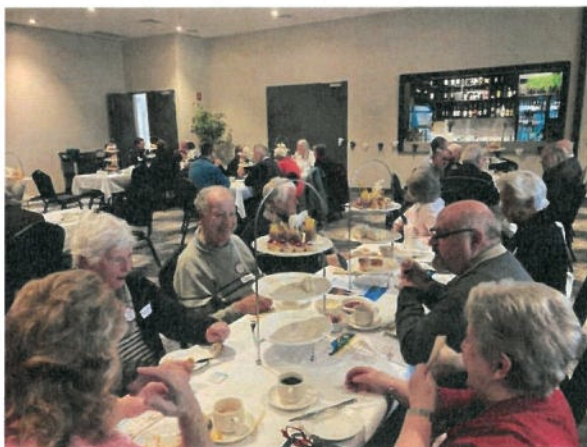
Together at last! Volunteer Week Morning Tea