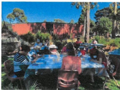
Black Saturday Anniversary Art Session

Spring Open Day & DIY air-dry clay activity - 8 & 15 September 2022