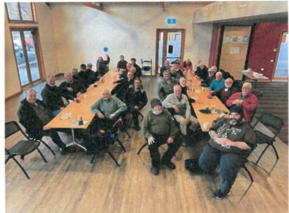
Back at the CAC!