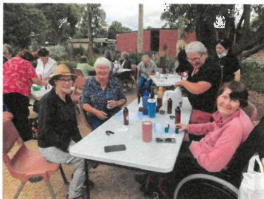
DIY Cleaning Products