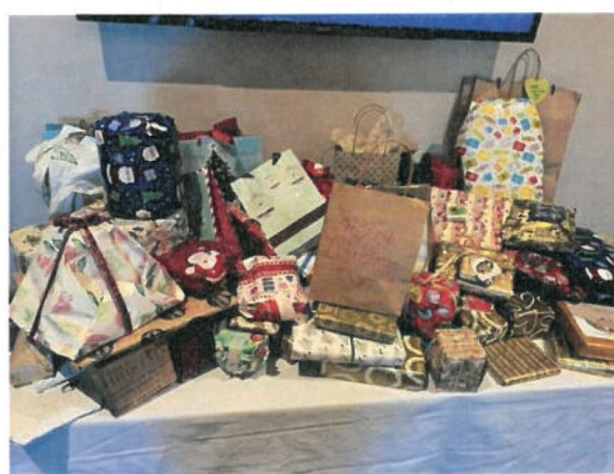
Everyone was in the Spirit for Christmas!