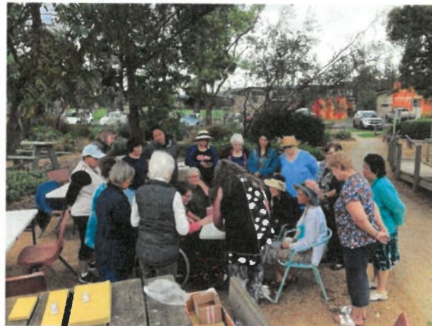
Bees Wax Candle Workshop