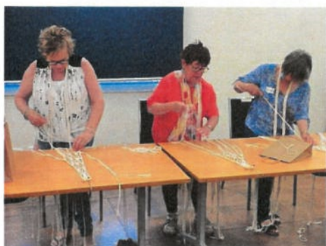
Craftermoons brings people together