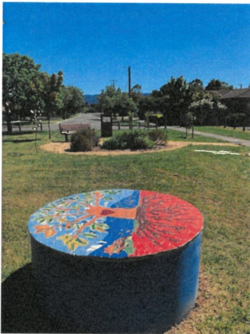
Mosaic Installation at the Lemon Tree Project

For all of this, we would like to thank the Whittlesea Community House staff and committee of management, as well as the City of Whittlesea, Bunnings and the Whittlesea Township community for their continued support which has enabled the garden to flourish in the past year. We look forward to the ongoing success and growth of the garden and the many benefits it will bring to our community.