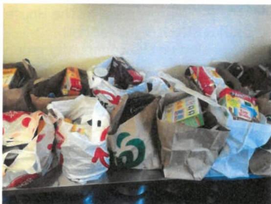
Pantry Packs with thanks to local donations

From everyone participating in House Foodshare, THANK YOU to the House Staff and Committee for your compassion and willingness to assist.